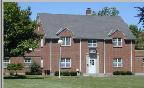
1 Old Fraternity Row

On October 6, 1963, Delta Lambda was formed as a local fraternity by 17 students. In February 1964, Delta Lambda was granted associate membership in the campus IFC, and in the summer of 1964, Delta Lambda submitted a petition for a charter in Alpha Sigma Phi. That Fall semester, the group moved into on-campus housing at 1 Old Fraternity Row, the chapter house Alpha Sigma Phi called home for 50 years until it was torn down in the summer of 2014. On October 3, 1964 the group was formally colonized in ceremonies at the University of Toledo's Beta Rho Chapter and on March 13, 1965, the chapter was re-chartered.