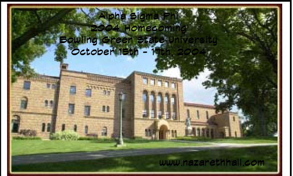
Don't miss Homecoming 2004! Enjoy Saturday evening's dinner at the historic Nazareth Hall in Grand Rapids (pictured above). See inside for more details on the entire weekend!