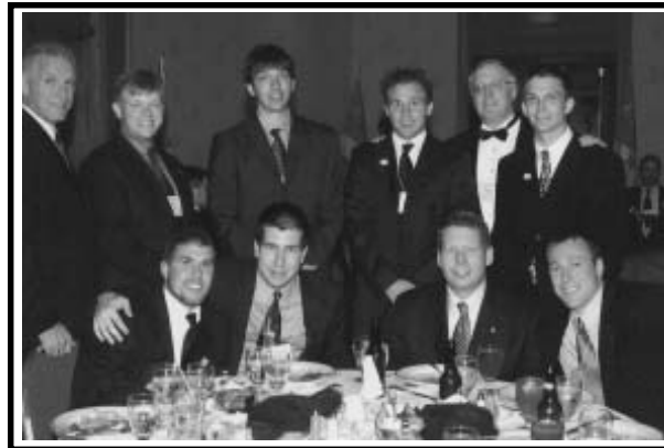
Left: The National Convention delegation takes time to celebrate the chapter's success throughout the year, taking home numerous chapter and campus awards and recognition! Congrats to the chapter!