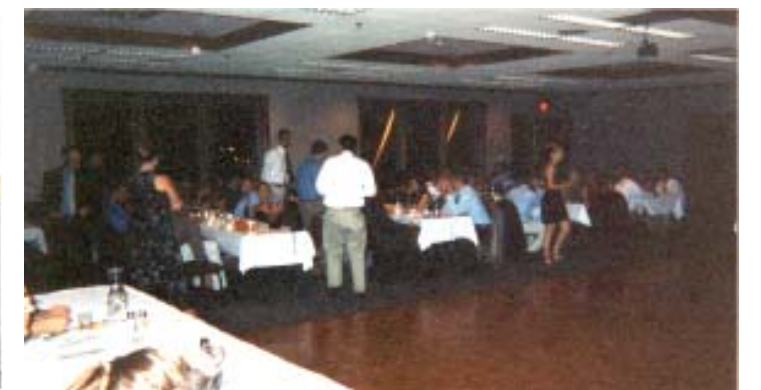
Some images of Homecoming 1999. At left, alumni enjoy tailgating before the BG football game. Above, Alumni, family, undergrads, and dates enjoy the dinner and dance at the Elks